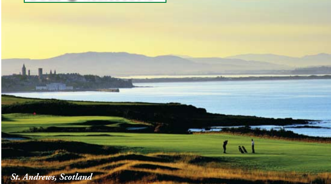
St. Andrews, Scotland