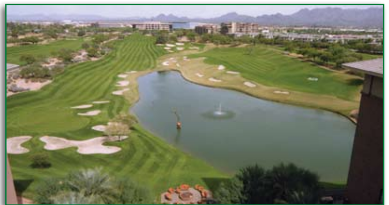
View from Room 1014 at Westin Kierland Resort