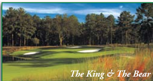
The King & The Bear

It's easy to expect the world with a name like World Golf Village, but St. Augustine surpasses expectations quicker than a Tiger Woods's booty call. From Pete Dye's notorious "Island Green" at TPC Sawgrass, to luxurious resorts such as Amelia Island Plantation, there is plenty of quality and challenge to go around. No visit to the area is complete without a tour of the World Golf Hall of Fame, where visitors are encouraged to pray to the enshrined that they might receive their iron play.