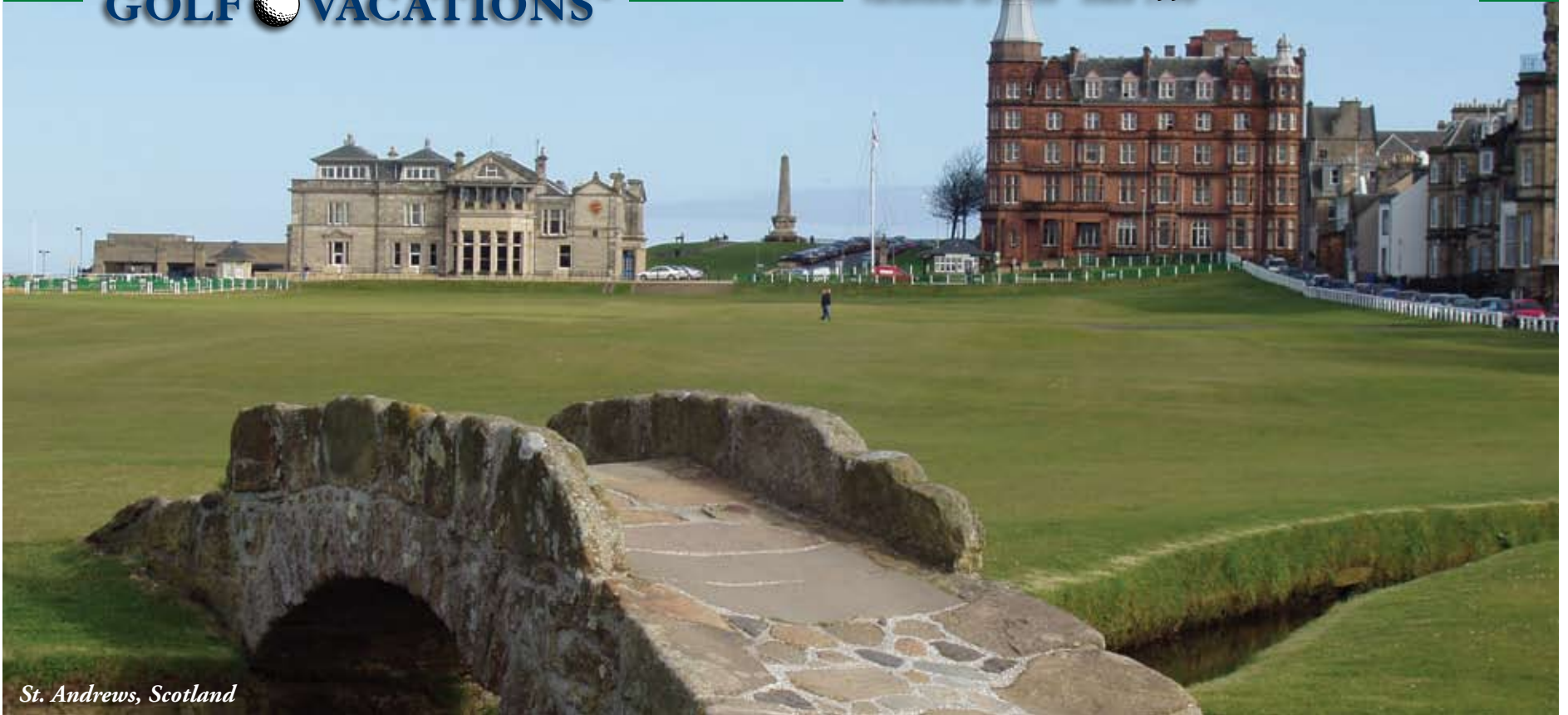
St. Andrews, Scotland