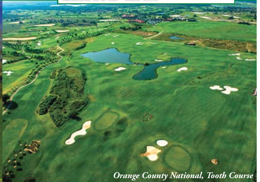
Orange County National, Tooth Course