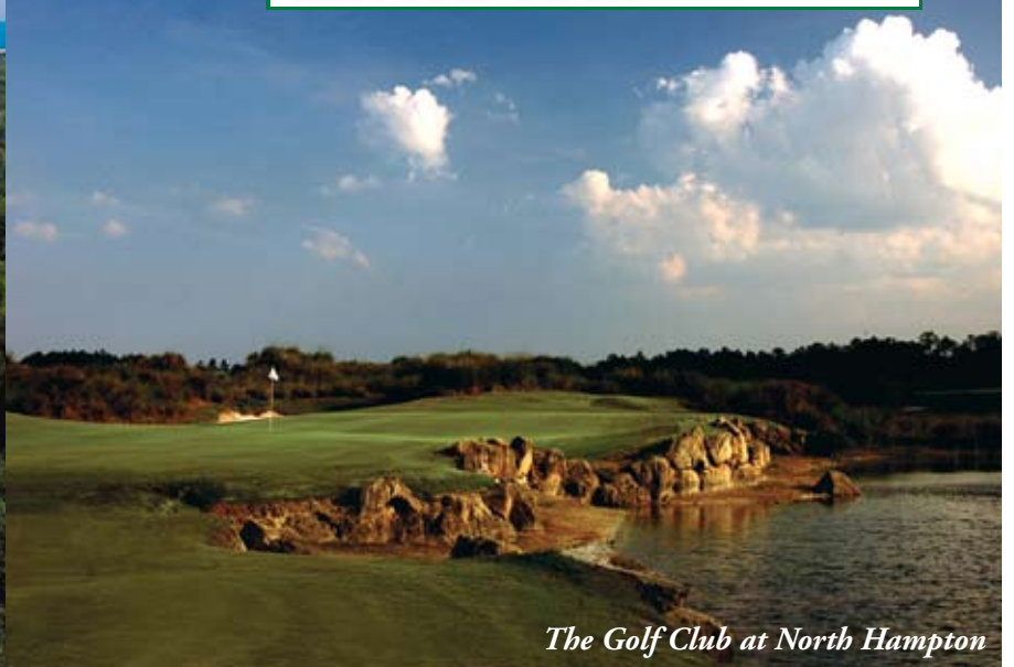
The Golf Club at North Hampton