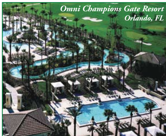
Omni Champions Gate Resort Orlando, FL

Well known for theme parks, sunshine, and a cartoon character whose initials consist of the single letter M, Orlando has emerged as one of the world's best golf destinations. Recent voting by more than 300 International Association of Golf Tours Operators (IAGTO) members placed Orlando as the 2010 North American golf Destination of the Year. With a variety of courses, abundant lodging choices, and its ease of accessibility (one of the few golf destinations with a monorail), it's plain to see why Orlando is a top choice for Fairways Golf and GolfThere.com customers.