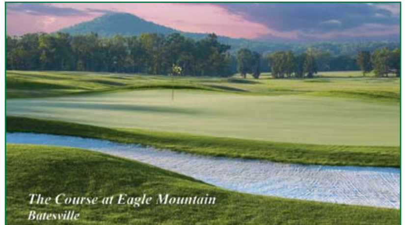
The Course at Eagle Mountain Batesville

The state's wine country serves its best in the Arkansas River Valley, which is also home to Fort Smith, the "Wild West" town that bordered the Indian Territory until 1907. For more recent history, former President Bill Clinton's boyhood home is open for tours in his birthplace town of Hope.