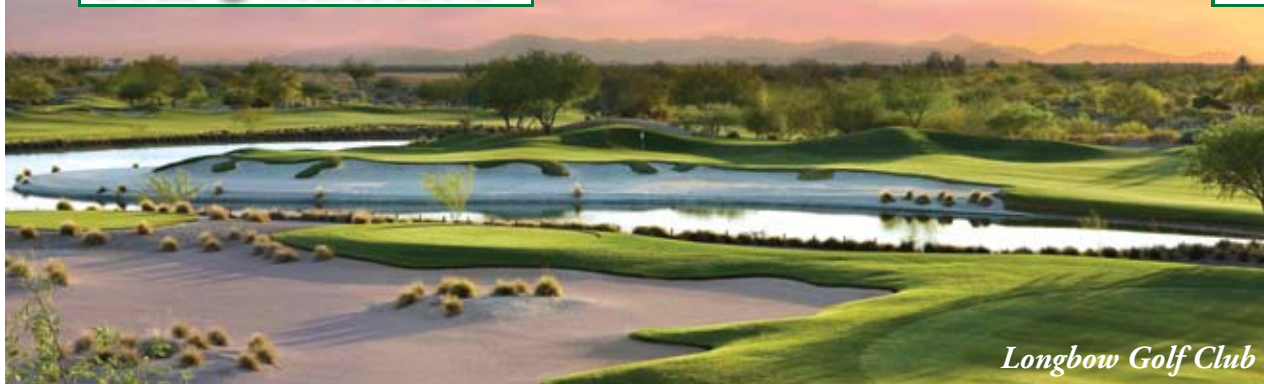
Longbow Golf Club