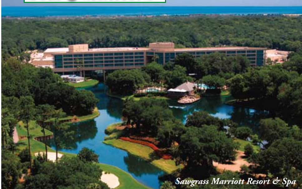
Sawgrass Marriott Resort & Spa