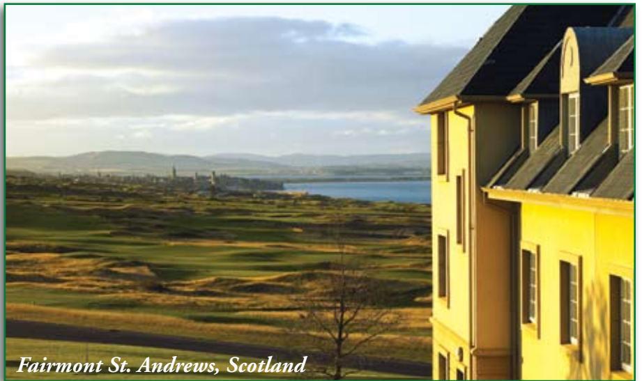
Fairmont St. Andrews, Scotland

GolfThere.com is a comprehensive website that includes more information about the destinations, tools to make trip planning easier, online booking capabilities for the do-it-yourself types, and better images and descriptions to let you know exactly what to expect when you arrive.