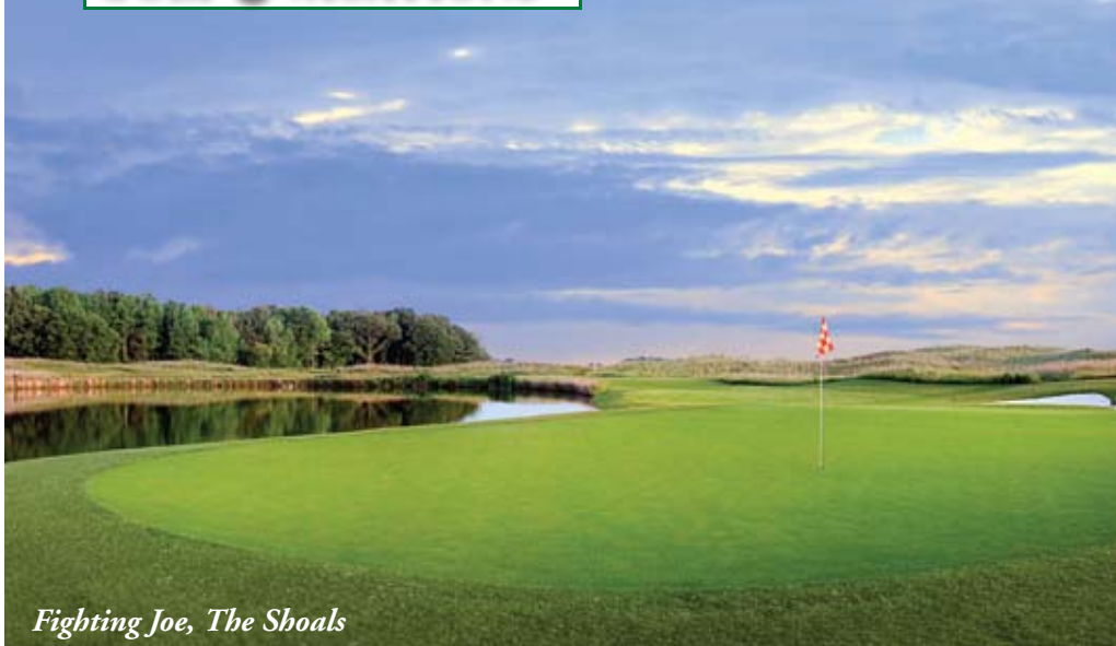
Fighting Joe, The Shoals