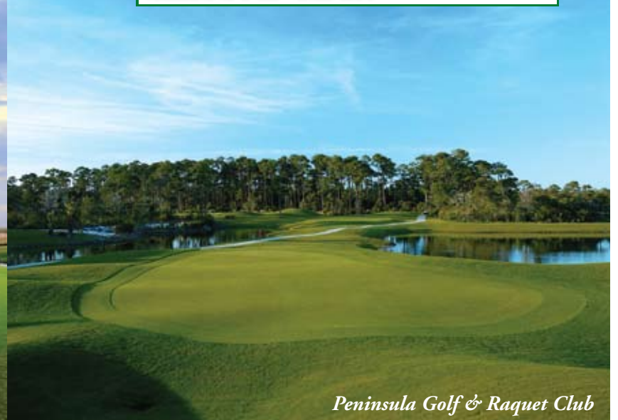
Peninsula Golf & Raquet Club