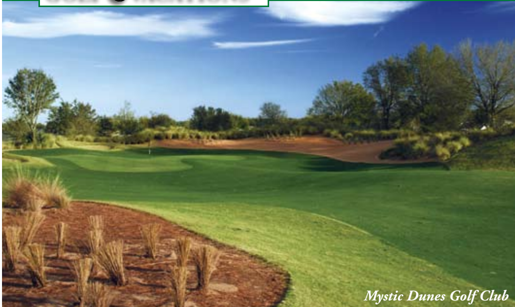
Mystic Dunes Golf Club