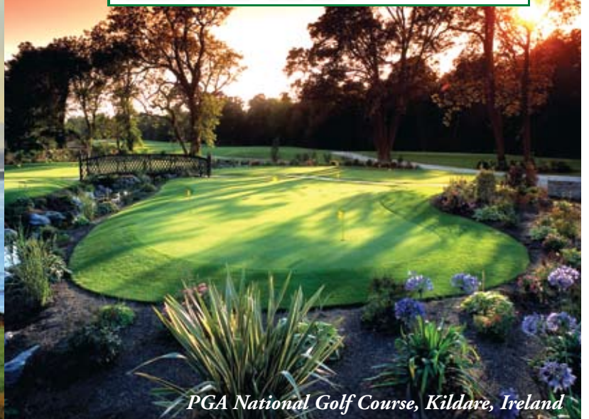
PGA National Golf Course, Kildare, Ireland