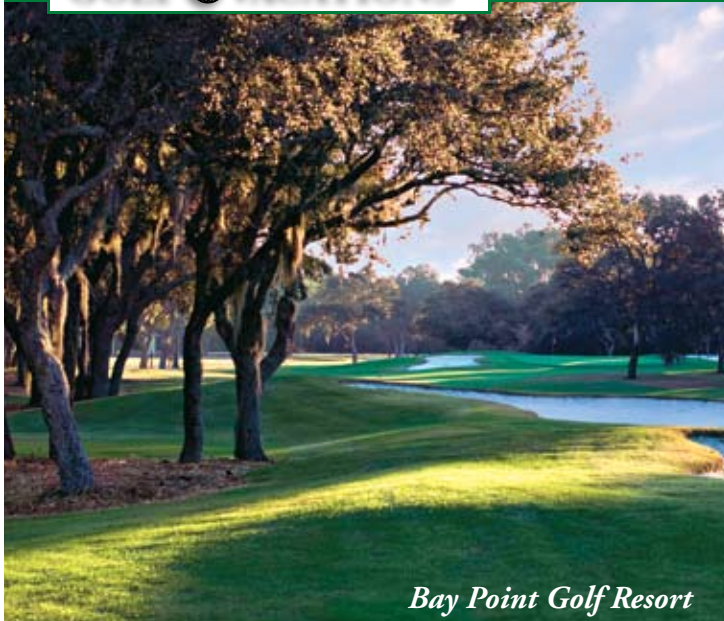
Bay Point Golf Resort