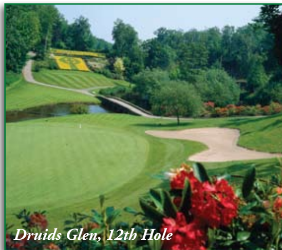
Druids Glen, 12th Hole

be just a grade or score, but useful comments about the terrain and the feel of the course. PGA Master Professionals will also regularly blog and communicate with you about their experience and opinions on the latest technology or a great destination that can refine your game.