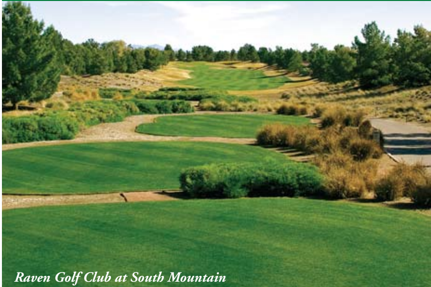
Raven Golf Club at South Mountain