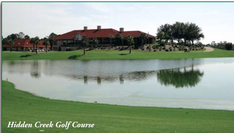
Hidden Creek Golf Course

From Miami to Jacksonville, and Orlando to Destin Florida, there are enough options that even the most specific schedule can be accommodated. Cool off from a round of golf in the Atlantic or the Gulf of Mexico and try to frown. While this may be impossible, Florida is quite possibly the best summer golf retreat.