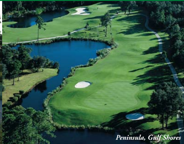
Peninsula, Gulf Shores