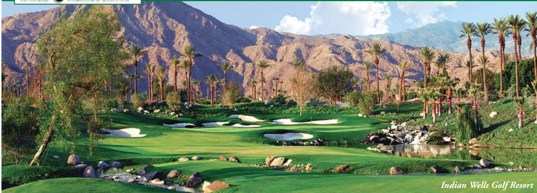
Indian Wells Golf Resort