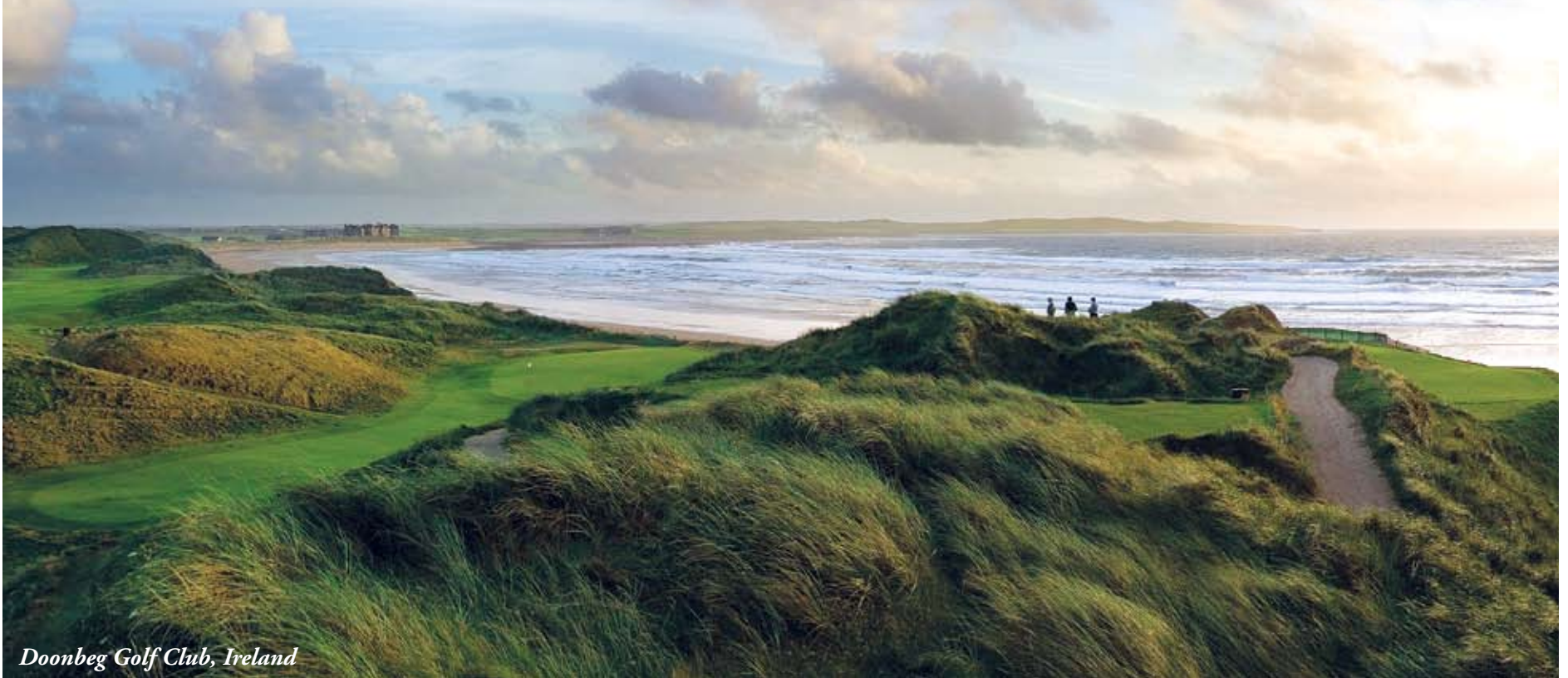
Doonbeg Golf Club, Ireland

Golf Travel News & Views for the Avid Golf Traveler