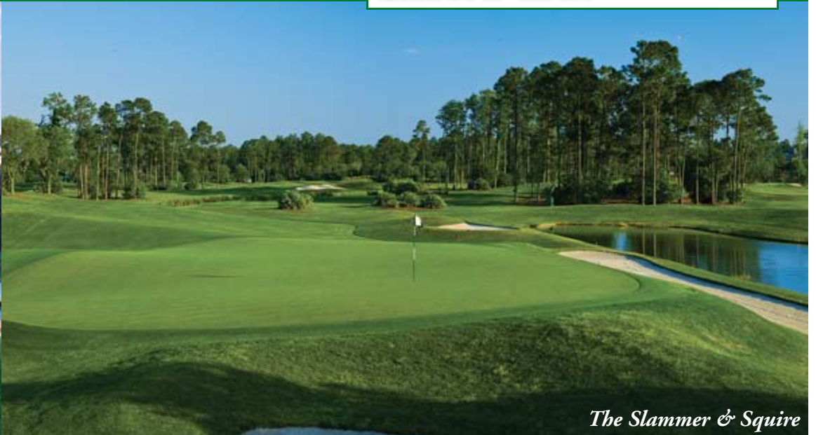
The Slammer & Squire