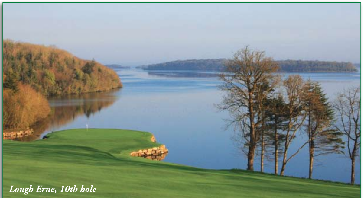
Lough Erne, 10th hole

In the past year or so, Fairways has expanded to include world-wide golfing destinations. We are on the way to becoming the first truly world-wide golf tour operation. Our team has also significantly improved our websites and domestic golf programs to create a community dedicated to outstanding value to our loyal golf travelers. In the months ahead, you will begin to see more and improved pages to our award-winning websites. Notably, you'll see user ratings and our own staff ratings of the golf courses that we sell. And it won't